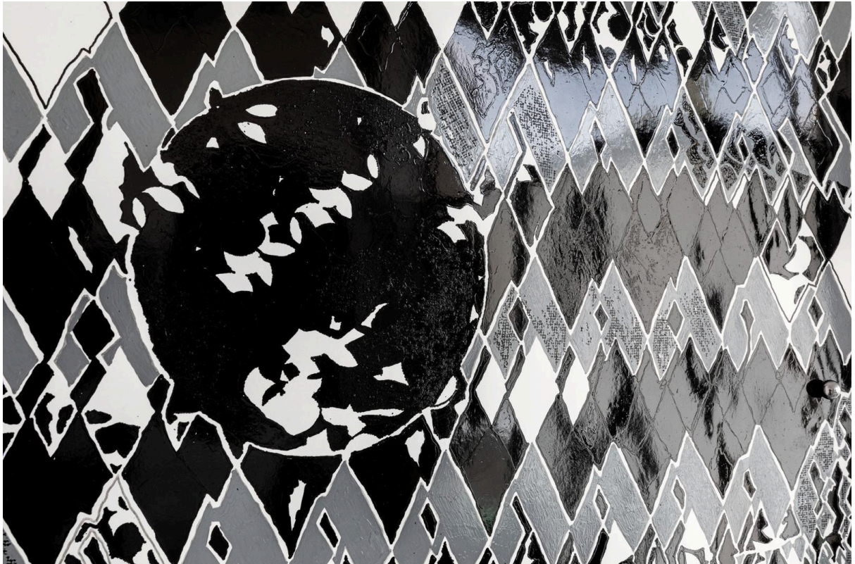
(Detail) Harlequin's fever dream (2), 150 x 110 cm, 2021

This unique technique, developed by the artist through an in-depth experimental process, allows him to achieve deep, thick blacks with a slight relief that reflects light in a way reminiscent of screen glows. This process blurs the boundaries between 2D and 3D, offering a new dimension to graphic art.