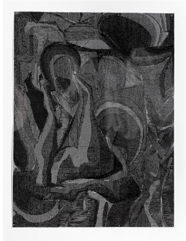
La promenade, 2024 Oil-based felt-tip pen on coated paper 160 x 120 cm

"When looking at my drawings, one wonders if they were printed or hand-drawn. The slight reliefs and reflections I achieve create a space oscillating between the screen and paper" adds Kamil Bouzoubaa-Grivel.