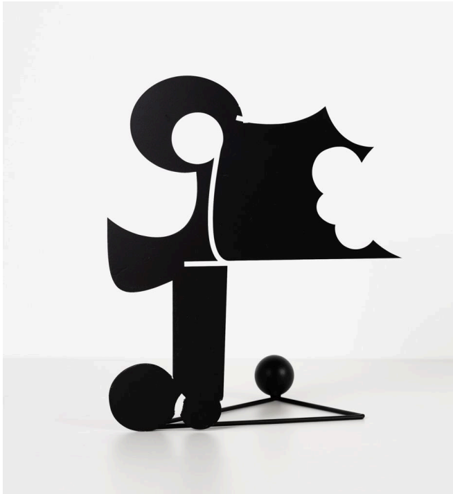
Oiseau Piment, 2023 (01) Steel, acrylic paint 38 x 31,5 x 16 cm Weight : 1,35 kg

Like his drawings, Kamil's sculptures are inspired by abstract comics and writing systems in general, ranging from cuneiform writing to hieroglyphs, including Mayan script.